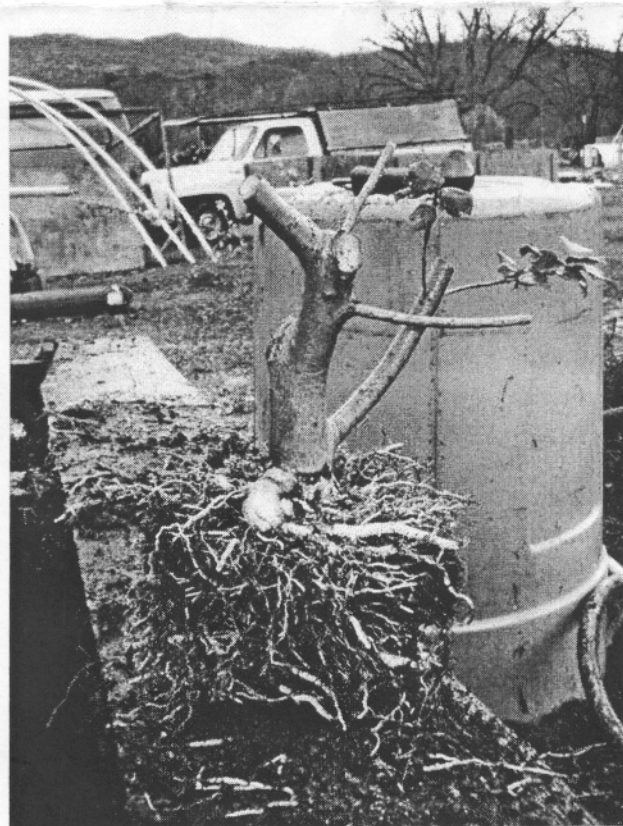
After using an ax to remove the outside layer of roots, soil was removed with a hose and root hook. They were then re-potted.