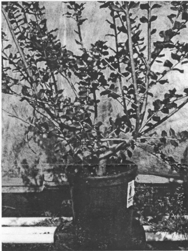
Above: A 1-gallon Luma before any work