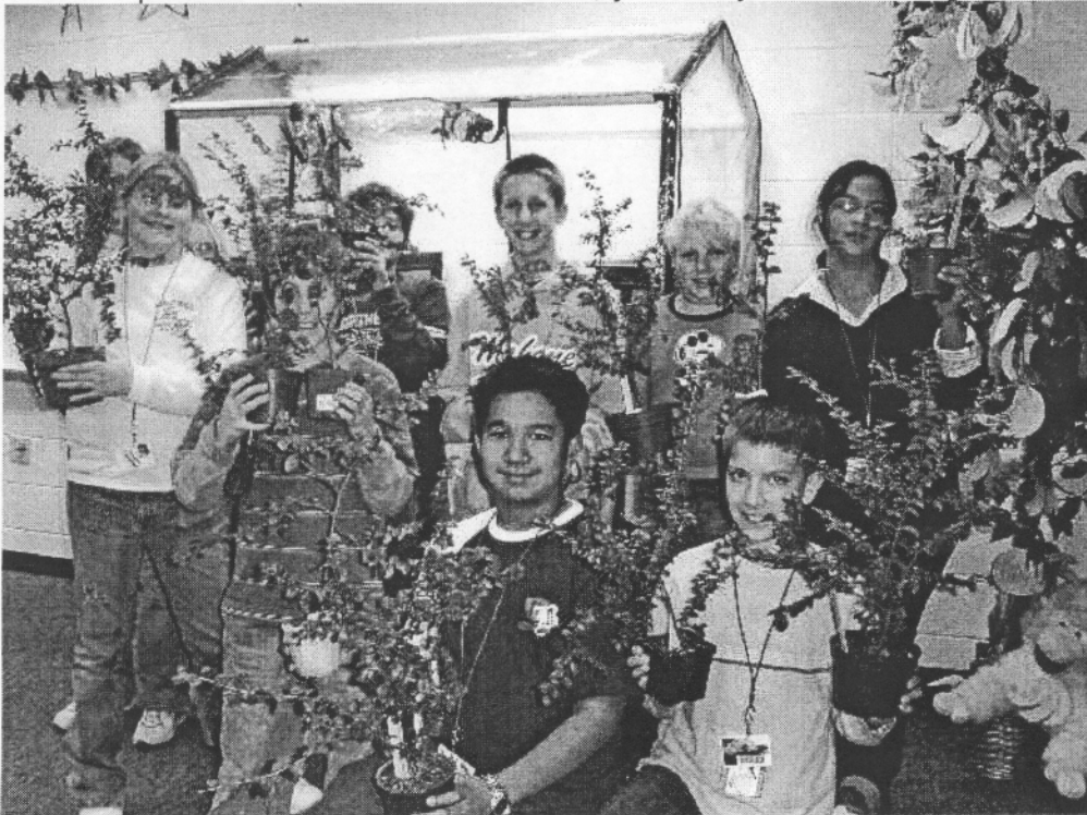
Some members of the Mahone Bonsai Club with their Luma trees