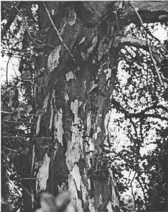
Trunk of very old luma in Ireland (UK forest service photo)