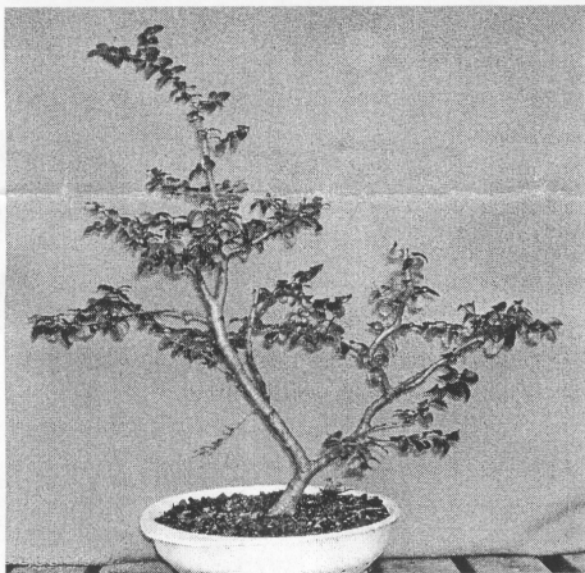
4 th year cutting from tree at right, 3/4-inch trunk

My original Luma, about 7 years old, and has a 1 1/2 inch trunk. It is still being allowed to grow and thicken the trunk, so the branch tips have not been trained, low branch intended to enhance taper. The roots of this tree are pictured at left