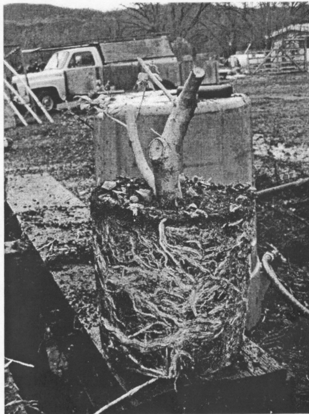
A pruned Luma ready root work. Pot-bound!