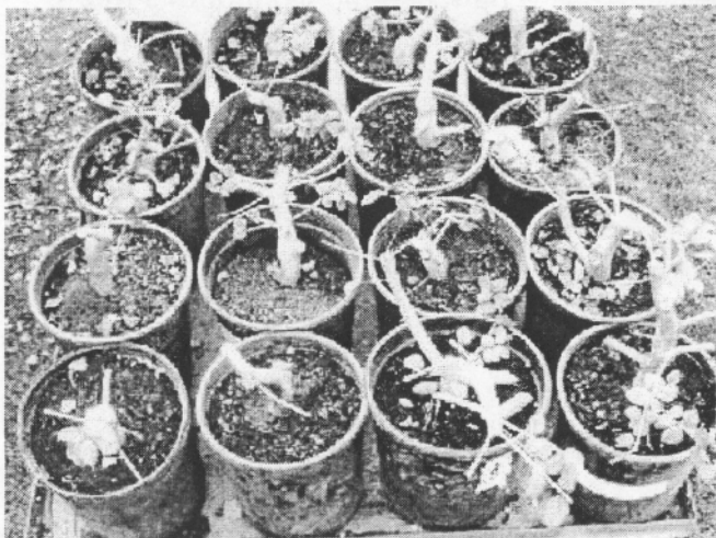
A batch of Lumas after initial pruning