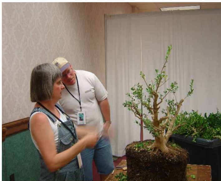
Can you put that side branch back on?