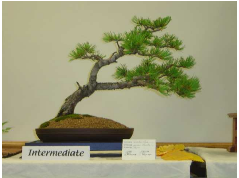
Limber Pine, 3rd Intermediate