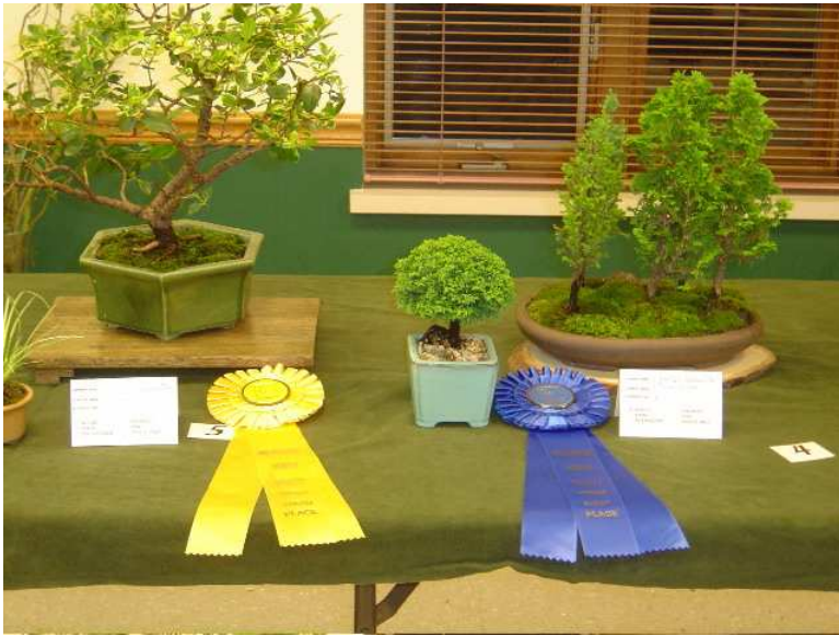
(Left to right) New Zealand Christmas Tree, 3rd Novice: Arborvitae/Juniper forest, 1st Novice