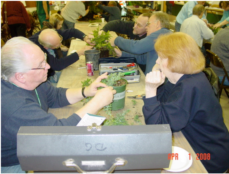
Collaboration is the key...