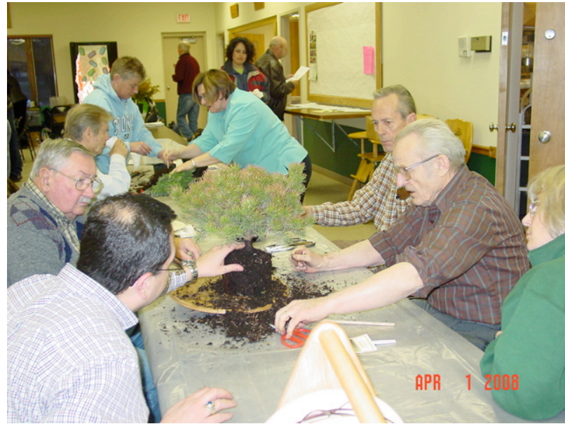
This is truly a group effort