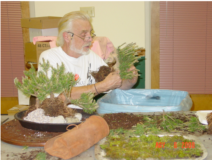
Our Tuesday 5/6 club meeting: