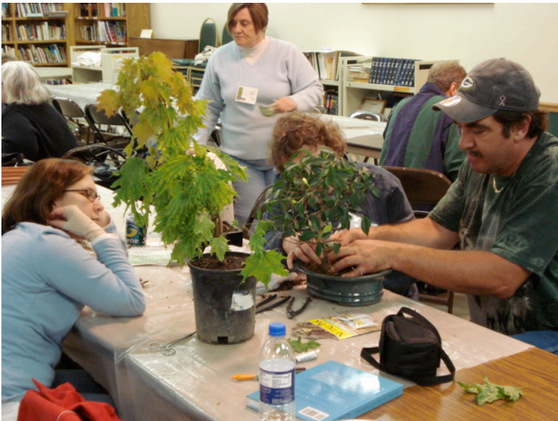
June Club Meeting Work night