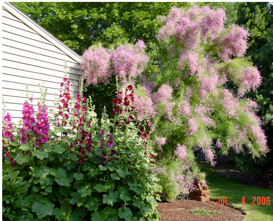
Tamarix and hollyhocks in my backyard -