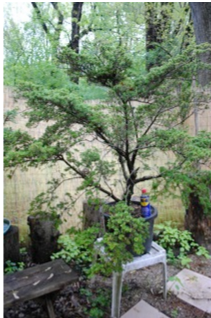
This is a Japanese Hemlock about 4 feet tall and approximately 7+ inches in diameter