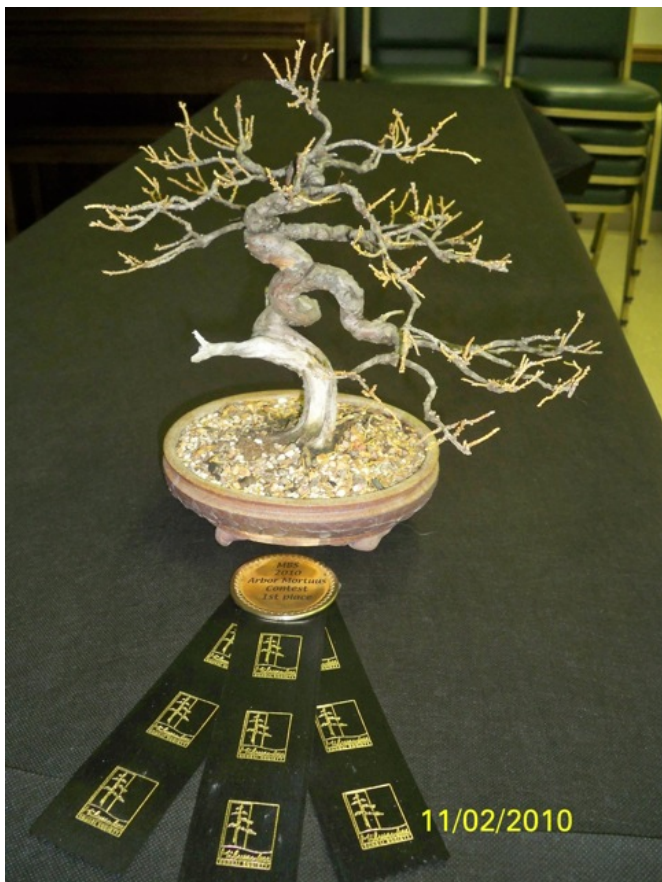
1st Place - Itoigawa shimpaku