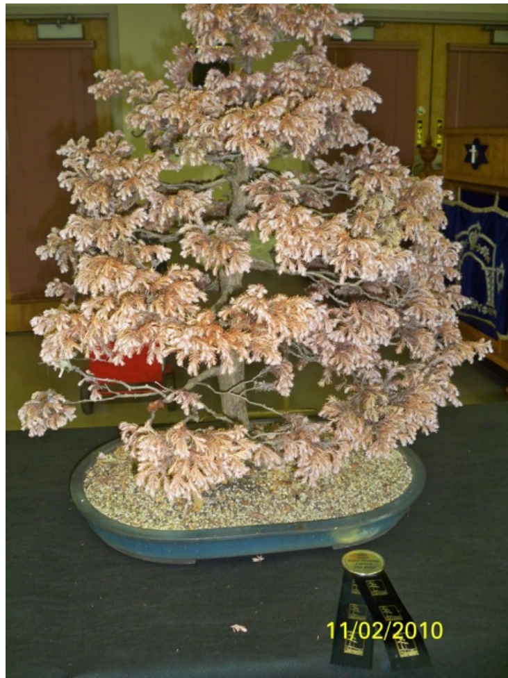
2nd place - Blue Moss Cypress