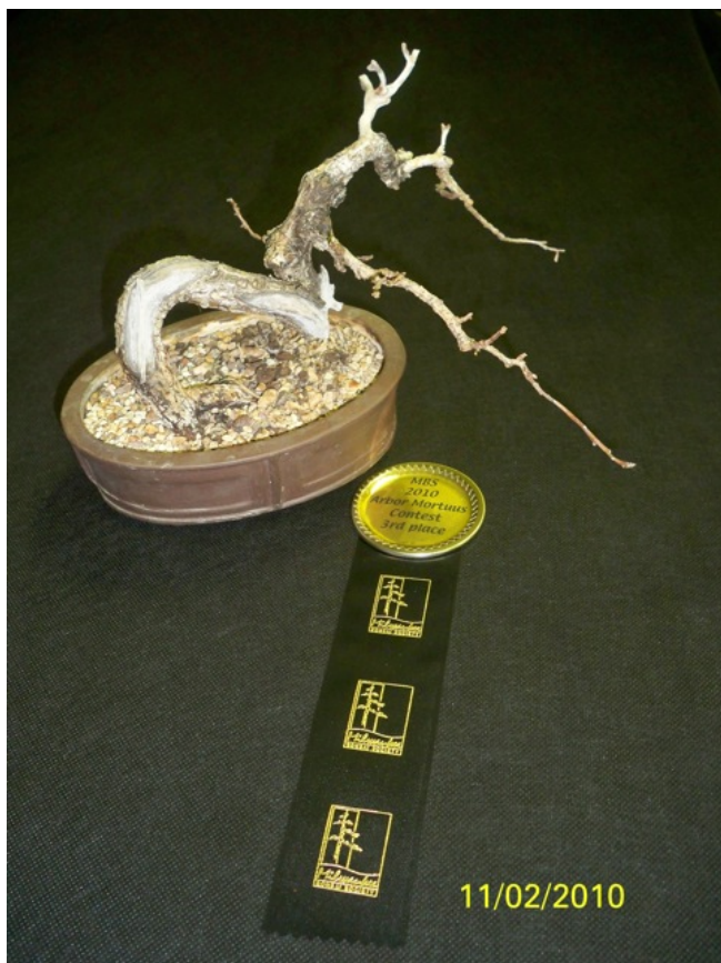
3rd Place - Buttonwood