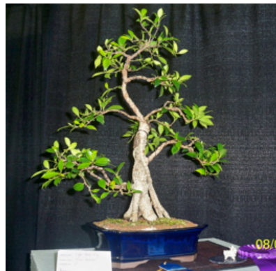
Willow Leaf Fig (O) - Ron F