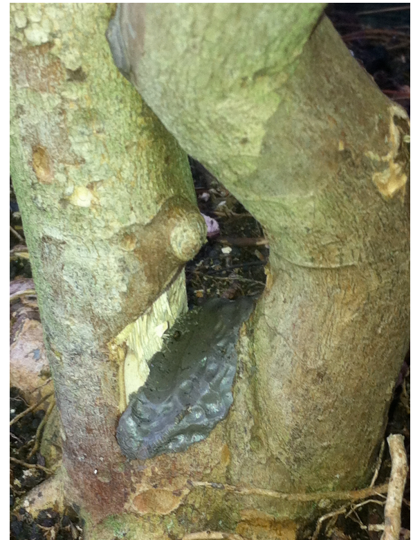
Calluses - Part 3 next month on conifers