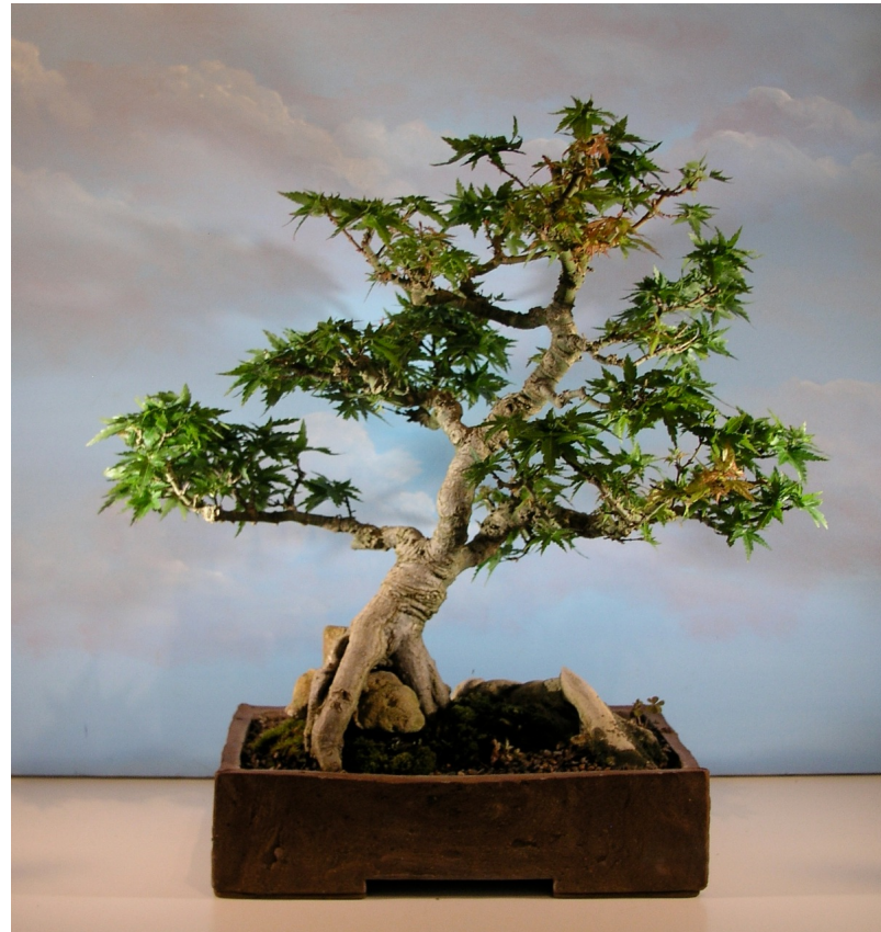
An example of a blended tree by Pauline Muth. It is a kotohime maple about 13" tall. Over 10 years old.