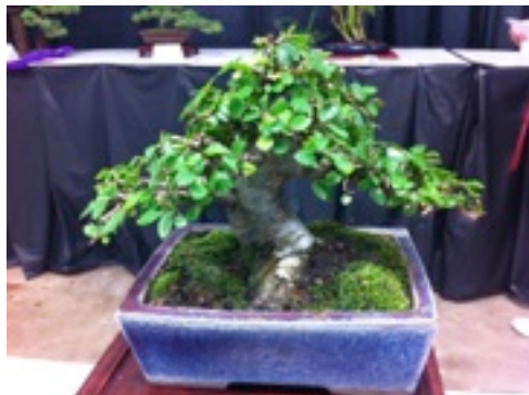
Chinese Elm (A) - Pam W