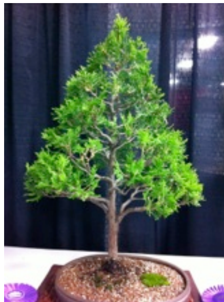
Golden Cedar (I) - Jim T