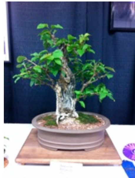
Bougainvillea (A) - Kris