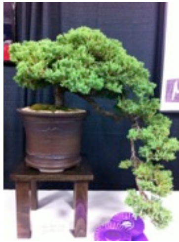
Juniper (I)