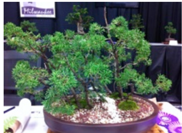
Shimpaku juniper raft (I) - Teri W