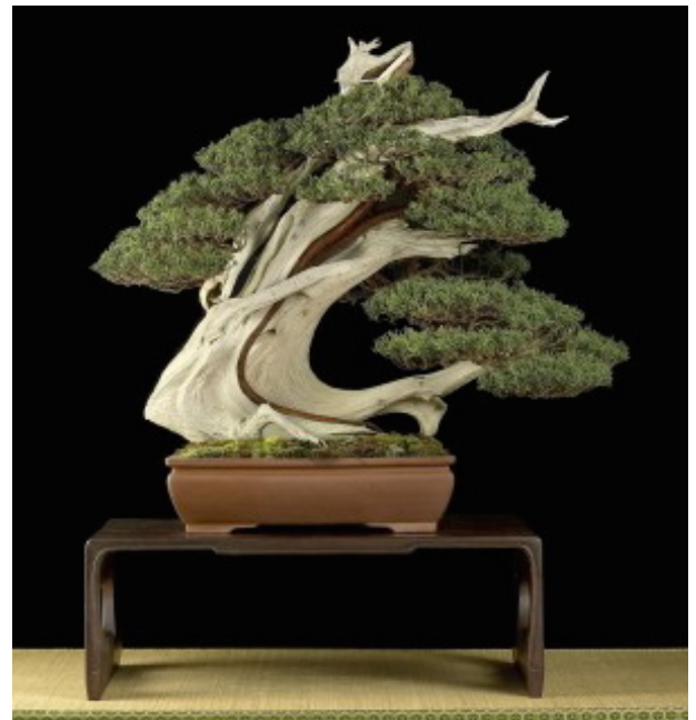
MASAHIKO KIMURA EXCELLENCE AWARD 2013