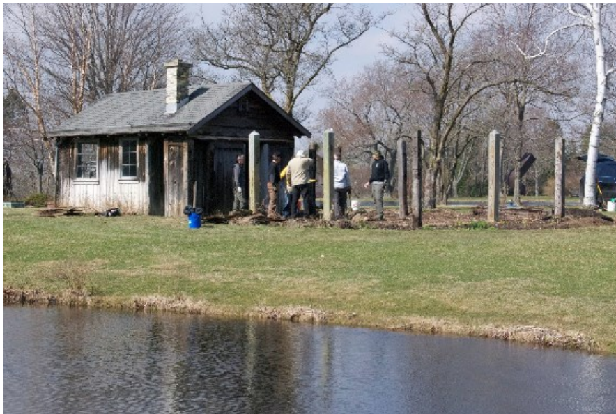
All that's left is a little clean-up.