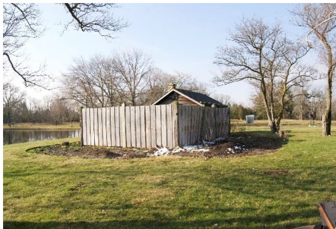
The existing Changing House with fence before we started