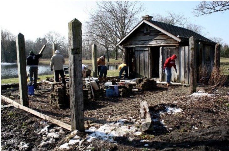
The fence is down and the work of lifting the brick pavers has begun