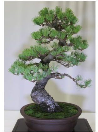
Red —Japanese White Pine Judy S