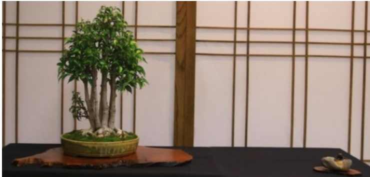
Best of Show Little Leaf Ficus Steve C