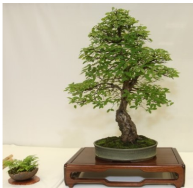
Yellow —Eastern White Pine Kathy K