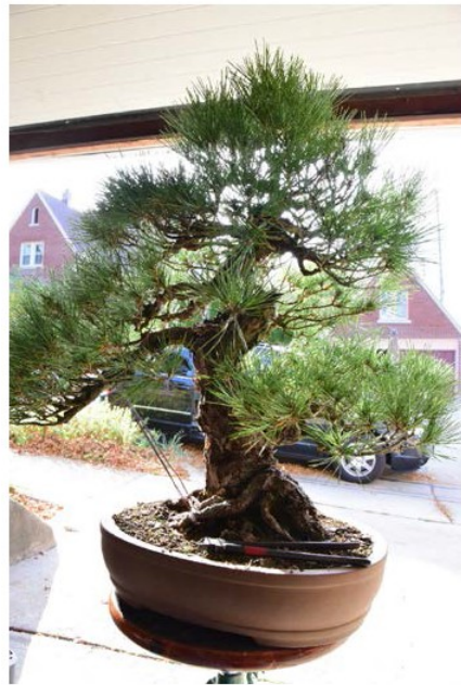
After bending and securing with copper guy wires... the rebar is removed. Notice the degree of bend.