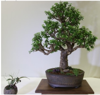
Blue —Elephant Jade Penny T