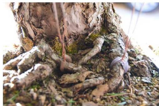
The guy wires are attached around roots.