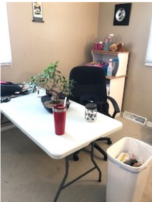
(the James bonsai workroom)

My trees are loving the warmer weather we are having and are growing like crazy. I, for one, am very happy winter is finally over; I have been ready to work on my trees for a couple of months now and my bonsai room has been set up for weeks!