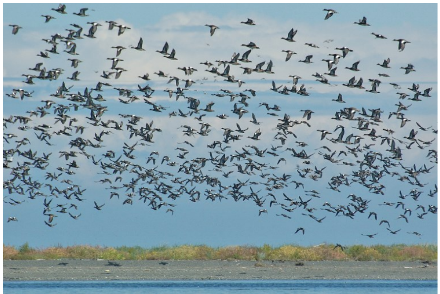
Autumn birds flocking Dipping and weaving as one Ballet in the sky