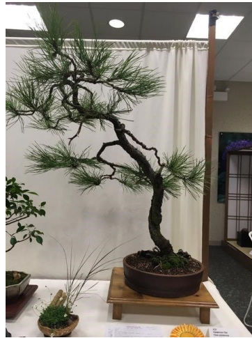
3rd Place - Ponderosa Pine - Terri W