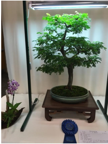
1st Place - Brazilian Raintree - Penny T