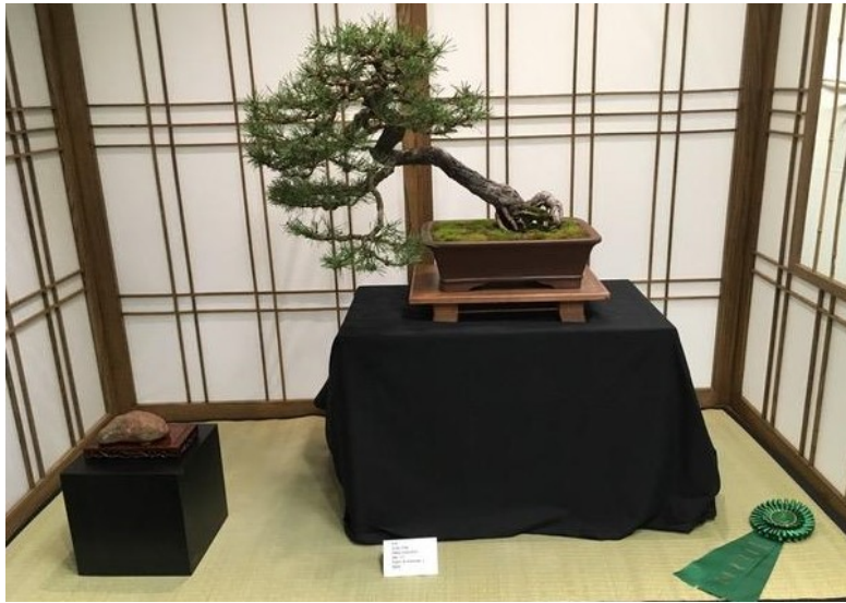
Scots Pine—O- Pam W