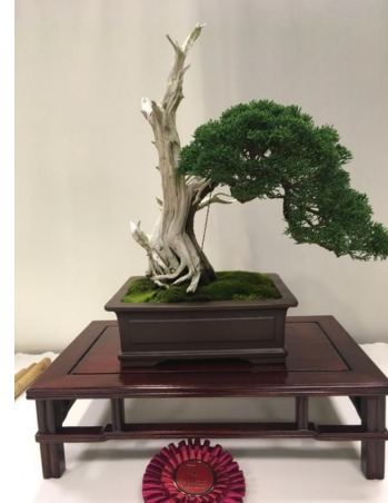
2nd place — Shimpaku Juniper - Jack D