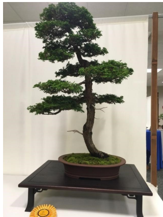
3rd place — Hinoki Cypress - Rocío S