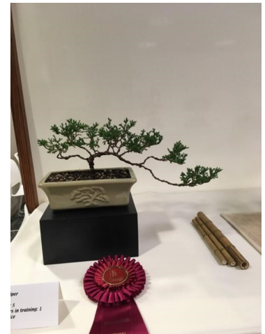
2nd Place - Juniper - Erich B