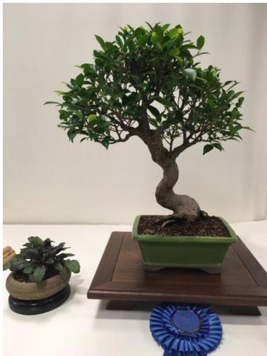
1st Place - Tiger Bark Ficus - Rena P