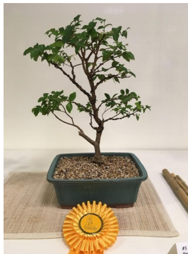
3rd Place - Brazilian Grape—Erich B