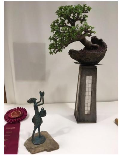
2nd Place - Spekboom - Kevin S