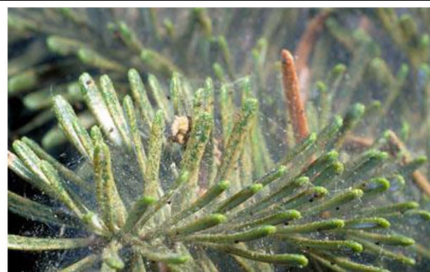
Spider mites attaching Yew

Spider mites – are small creatures which feed on trees and plants. Spider mites look green when they are young, later becoming a grayish color. If you notice yellowing or loss of foliage on your yew bonsai, it may be caused by these critters. Untreated spider mite populations can quickly increase and threaten plants. Spruce spider mites and rust mites often attack yew and can cause significant damage in just one season. Horticultural oil or insecticidal soap can be used during the growing season, along with a dormant oil in the winter to control the egg population (see the second installment Juneperis Spruce spider mites).