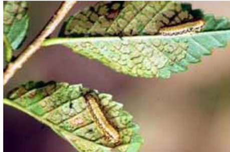
Elm Beetle and Larvae

To fight the elm beetle, use an insecticidal soap or product containing Spinosad (See Salix - Striped Cucumber Beetle ). To fight the larvae use a product containing Bacillus thuringiensis .