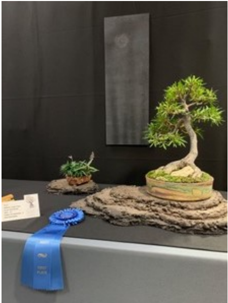
Intermediate 1st place