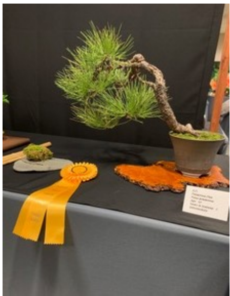
Intermediate 3rd place