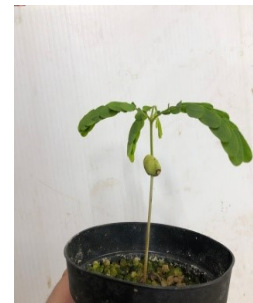
My Newest Baby

Like with a bonsai, the friendships can last a life time.