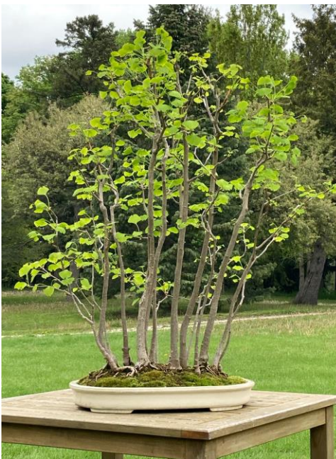
This Ginkgo grove is one of the Bonsai on exhibit at LSG. All trees for this grove were collected in Bay View area as part of an MBS club dig in 2010.