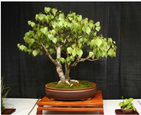
This Birch Bonsai Collected in Upper Michigan in a run-down golf course in 1995. Displayed at the National Exhibit in 2023 by the author.

There are many abused trees in either commercial landscapes or neglected home plantings.