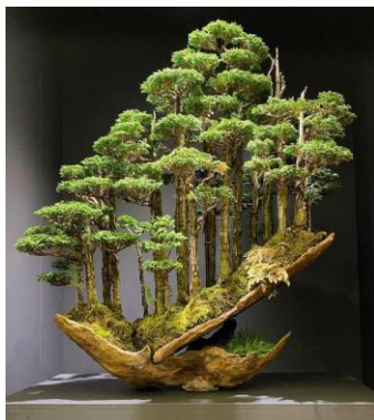
One of the most famous forest Bonsai, by Masahiko Kimura.