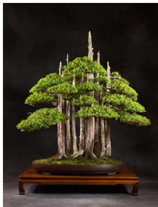
This Bonsai is named Goshin, a forest planting of eleven Foemina junipers by John Naka.