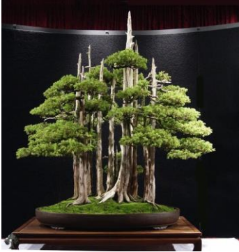
Naka's masterpiece Goshin is on display at the United States National Arboretum.